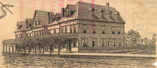
High School Building, corner 12th Ave. and Yale St.