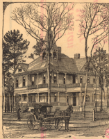
Residence on Boulevard and 18th Ave.