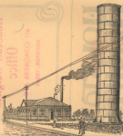
Houston Heights Water and Electric Light Plant