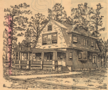
A Residence in Houston Heights