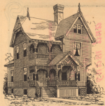
Residence, corner Boulevard and 19th Ave.