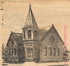
First M. E. Church, Harvard Street near 10th Ave.